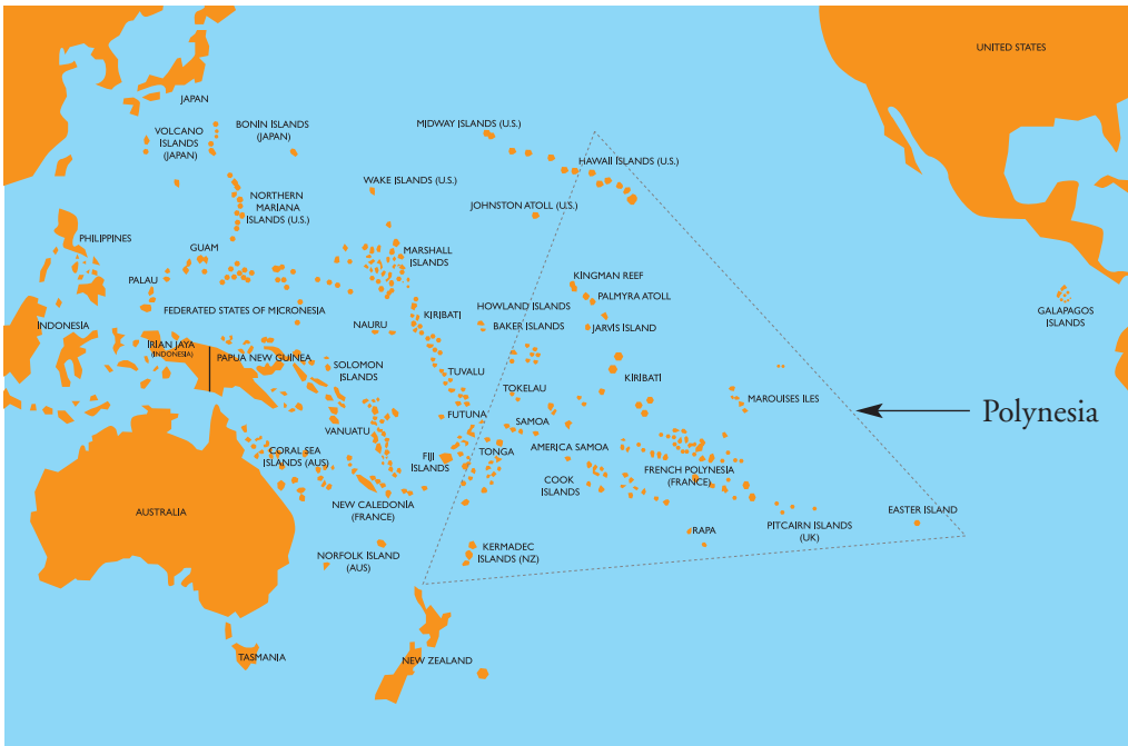
Figure 2: Map of Islands of the Western Pacific, showing the limits of Polynesia

children. Action-oriented literature from Papua New Guinea reveals almost no studies of violence (Sandvik-Nylund, 2003). But taking the whole island of New Guinea and the historical ethnographic record into account we found an extensive literature. Moreover, as anthropologist L. L. Langness suggests, ‘with several hundred distinct languages, and with a huge number of autonomous and often small and isolated political groups and cultures’, New Guinea would ‘appear to be a particularly fruitful area for the study of human variation’ (Langness, 1981, p. 13).